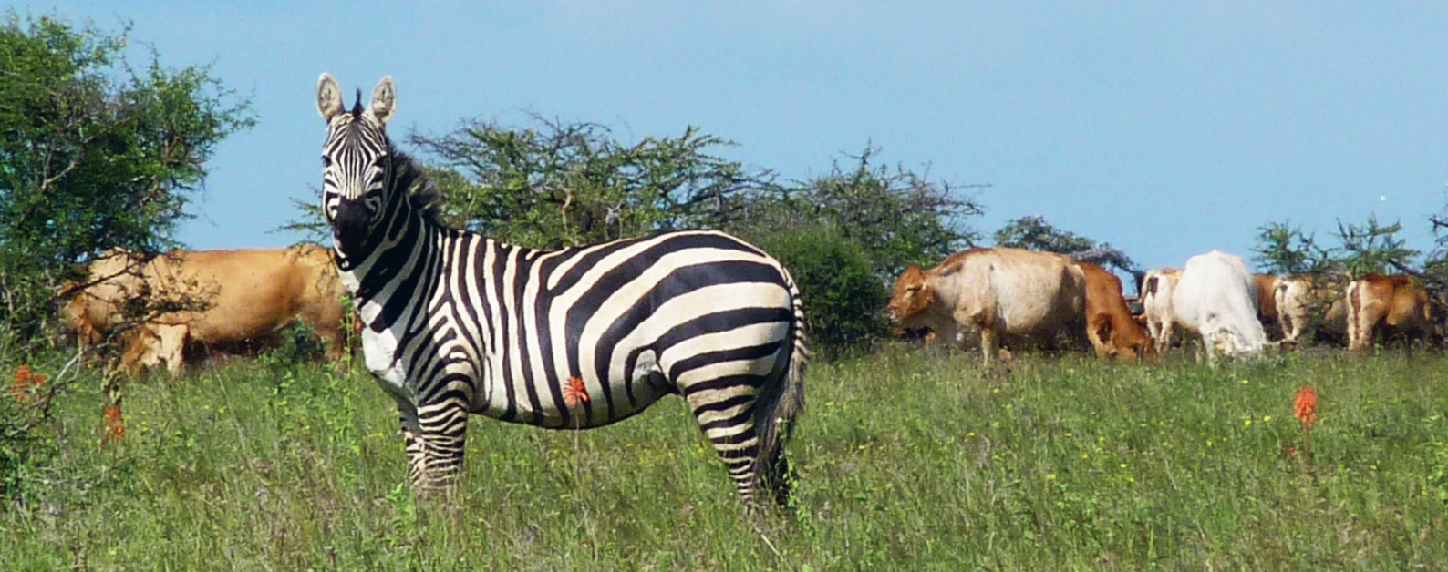
Wildlife and livestock grazing together near Kirimon, Laikipia North, Kenya