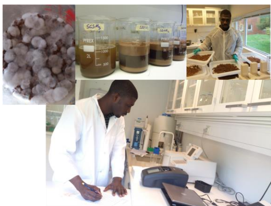
Laboratory testing to improve nutritional quality of agro by-products used in formulating ‘Susfeed’.