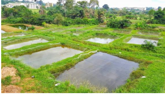
Ponds used in field testing the 'Susfeeds'